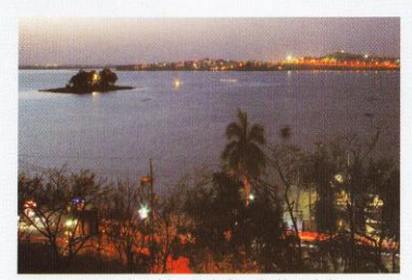
An overview of the old city from the Upper Lake

Gohar Mahal : Situated behind Shaukat Mahal on the banks of the Upper Lake is Gohar Mahal, which is an architectural gem dating back to