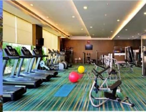
GYMNASIUM Our fitness centre is equipped with state-of-the-art cardiovascular & weight training equipment. MT & TRX class workouts.