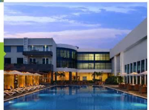
SWIMMING POOL Fourty pools with a separate kids pool are open to all guests.