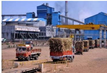
Saraswati Sugar Mill

Regd. Office: 5th Floor, Parishrama Bhawan, Basheer Bagh, Hyderabad (T.S) Admin Office: Door No.3-5-890, Flat No 315, Paras Chambers, Himayath Nagar, Hyderabad (T.S.)