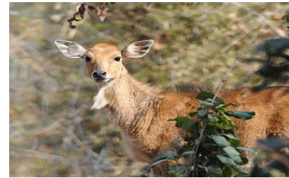
Kalesar National Park