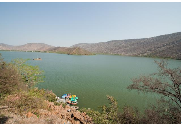
Siliserh lake Palace. 10 kms. from city center